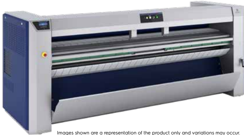
Images shown are a representation of the product only and variations may occur.